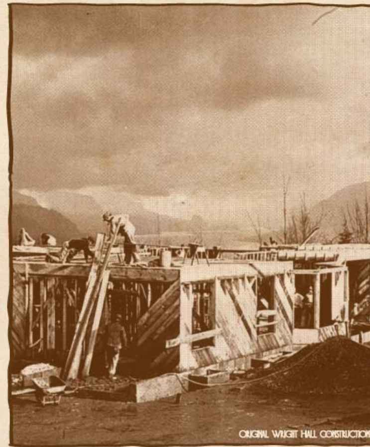
ORIGINAL WRIGHT HALL CONSTRUCTION

CELEBRATING THE 60 TH ANNIVERSARY OF MENUCHA RETREAT & CONFERENCE CENTER SUNDAY SEPTEMBER 12 TH , 2010 AT 5:30PM IN WRIGHT HALL WITH GUEST SPEAKER GERRY FRANK $100 PER TICKET OR $700 FOR A TABLE OF EIGHT YOUR TICKET WILL INCLUDE WINE, HORS D'OEUVRES & DINNER