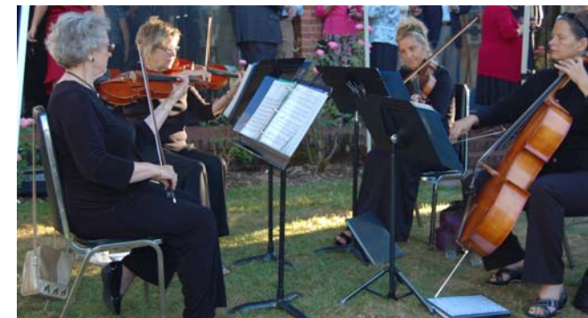
The Nightingale Strings